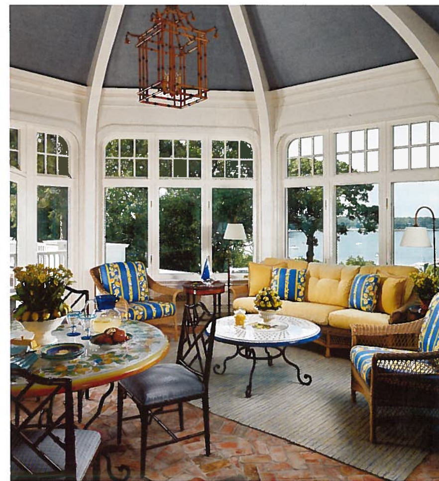
A hand cut brick floor mirrors the vaulted, beamed octagonal ceiling with charming bamboo lantern and grass cloth. Numerous windows and doors with paned transoms overlook the picturesque harbor below.

the outdoor pool, terrace, grounds and harbor. It is a magical oasis with full entertaining kitchen, bar and fireplace.