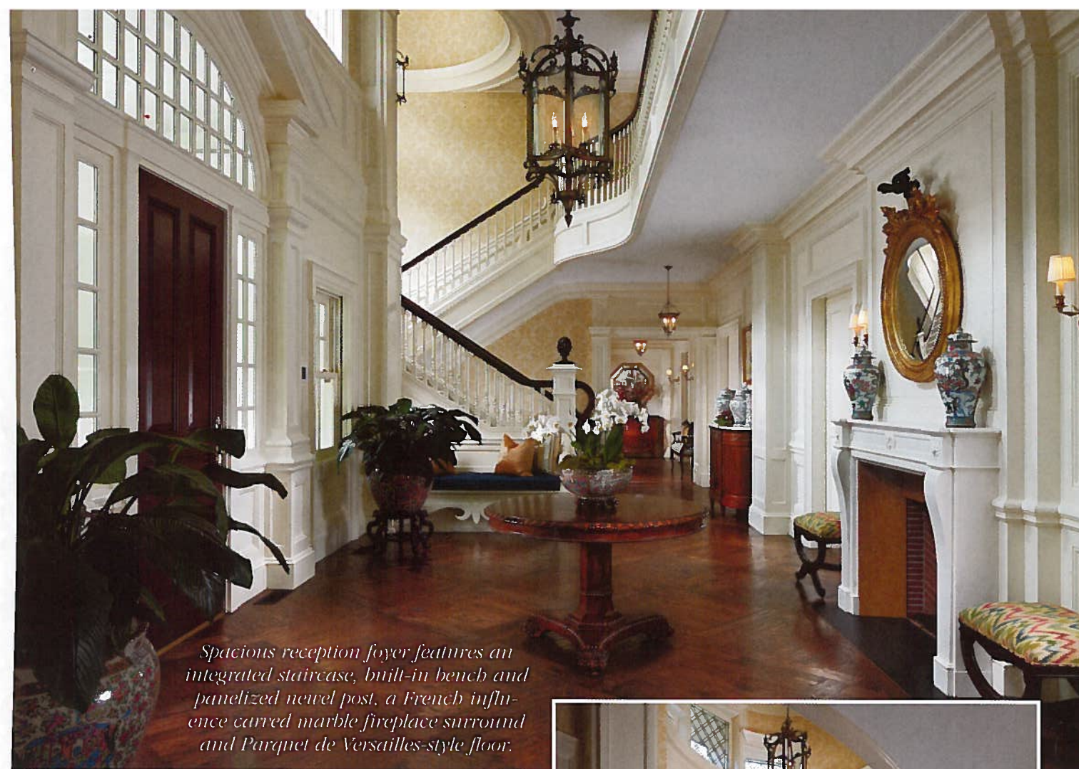
Spacious reception foyer features an integrated staircase, built-in bench and panelized newel post, a French influence carved marble fireplace surround and Parquet de Versailles-style floor.

Soft pink crape myrtle trees line the side lawn above the pool at the back of the house. Strong windows, columns and railings open up the rear façade to boundless water views.