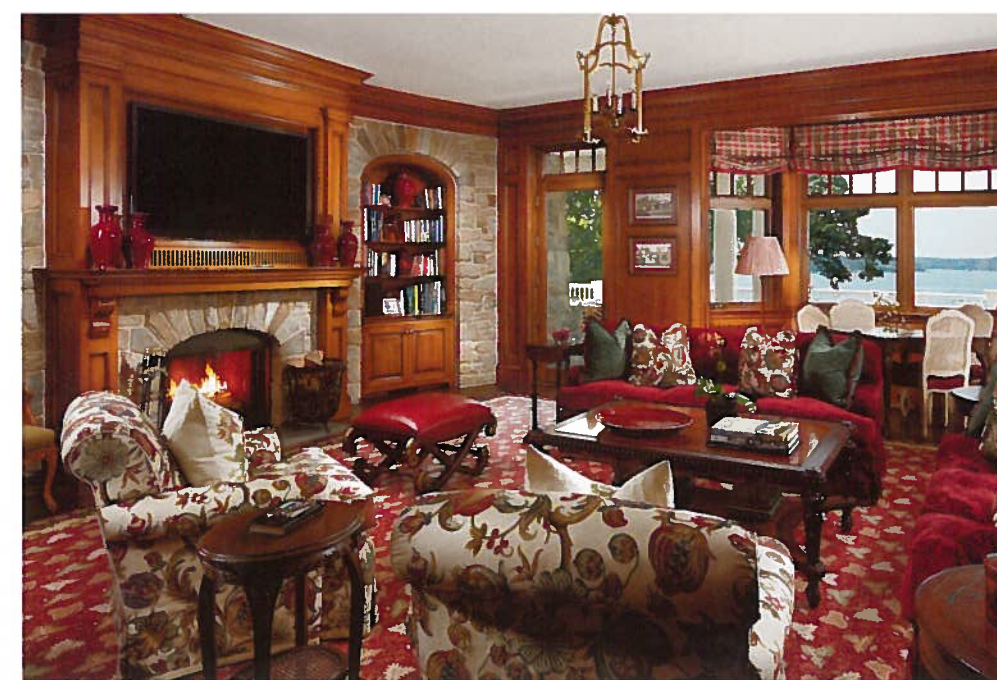
Westchester stone articulates warm antique fir paneling. A handsome bay window captures water views over the expansive rear deck.