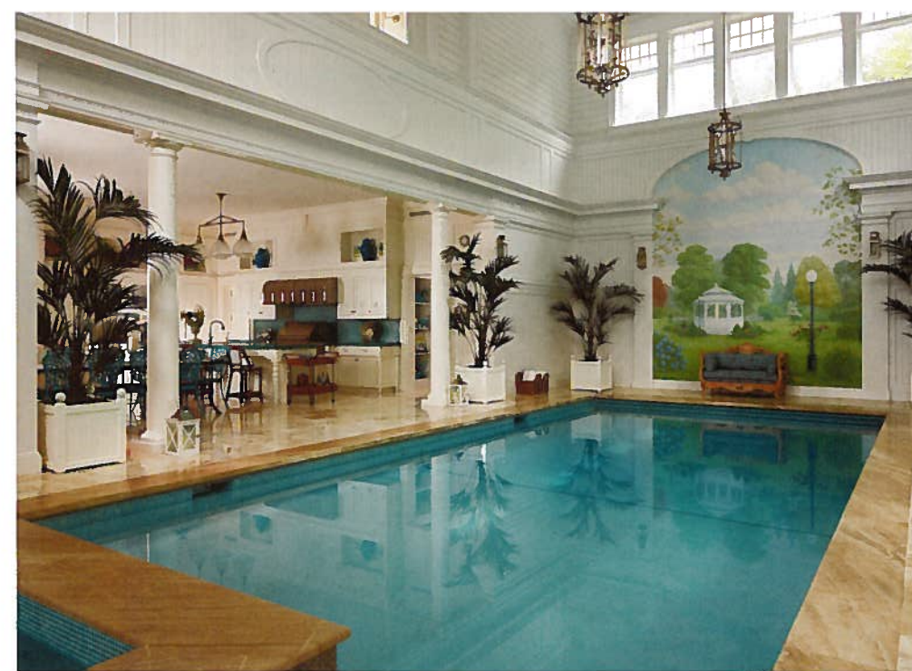
The family's "favorite" room boasts a sentimental hand painted mural on canvas, roll out pool cover to control temperature and humidity and salt water generator. A full, custom mosaic tile, spa kitchen with fireplace and bar graciously services the pool area.