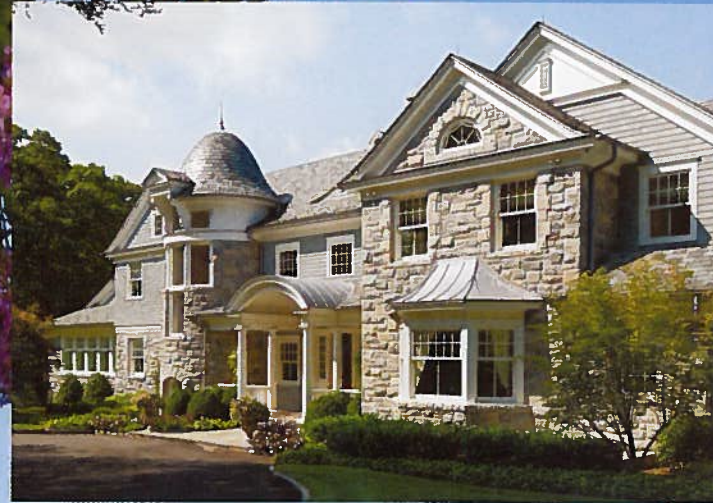
A barrel vaulted portico, fabulous turret and charming custom stone chimneys detail the inviting front façade.