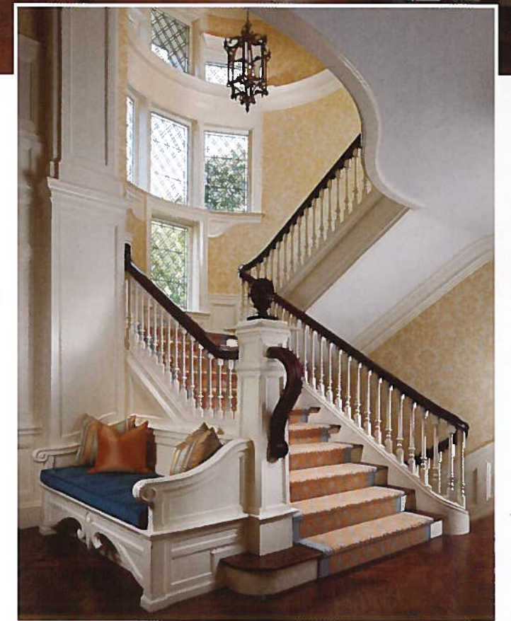
Circular stair tower with spectacular stacked leaded glass windows. Superb mahogany bannister and custom spindles run the length of the second story exposure.

Recently completed, this Shingle Style retreat evokes the sense of a vintage, late 19th century manor house with a playful massing of gabled ends and a delightful turret, fully clad in cedar shakes and anchored with stonework in the "Richardson-Romanesque style. Designed by