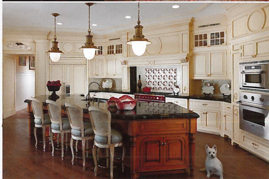
Anchored by an antique fir island with Verdi marble top, hand painted ceramic tile backsplash, CornuFe stove, custom designed and built Kean cabinets. "Brandy" awaits a puppy treat.

Kean, Willams, Giambertone Ltd, the animated slate roofline is trimmed in crisp white cornice work and copper. Abundant, historically correct fenestration showcases stunning water views. Beautifully appointed, with a mélange of architectural nuance,