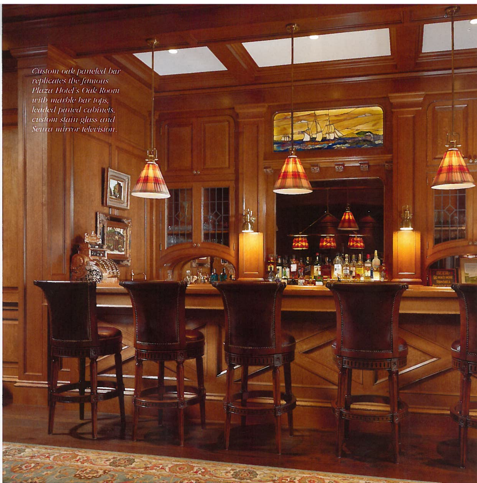
Custom oak paneled bar replicates the famous Plaza Hotel's Oak Room with marble bar tops, leaded paneled cabinets, custom stain glass and Seura mirror television.